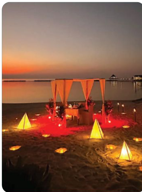
JAZEERA DINNER — USD 150++