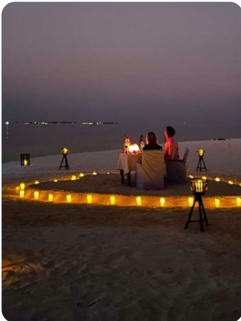
ROMANTIC DINNER — USD 100++

Seafood and Beef USD 150++ per person Seafood USD 250++ per person Vegetarian USD 150++ per person