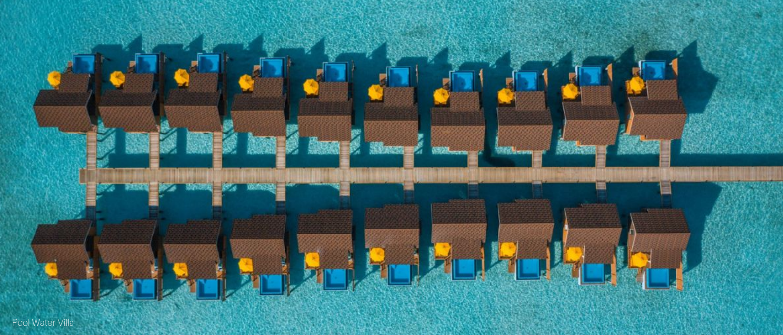
Pool Water Villa