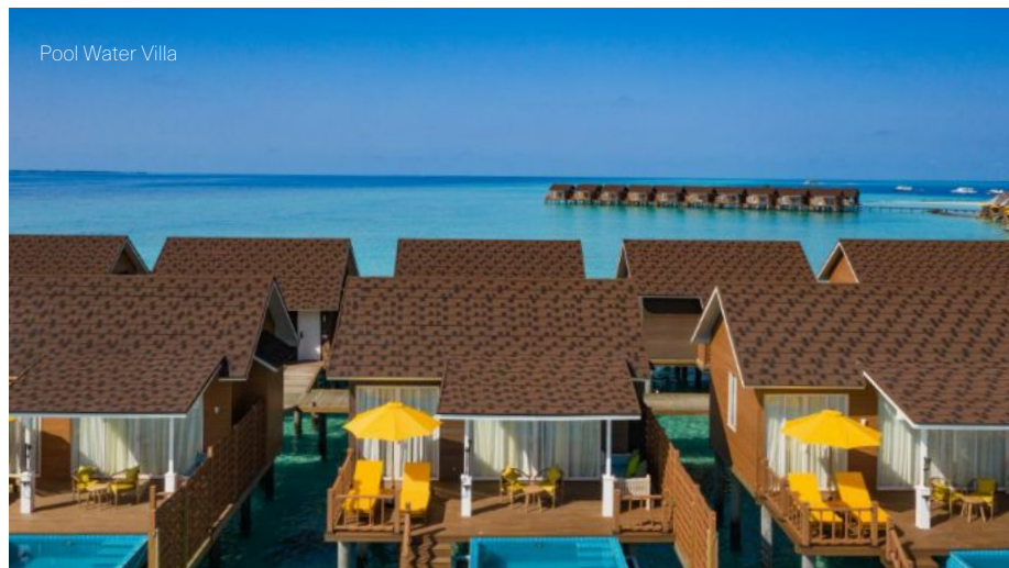
Pool Water Villa

Dhigufaru Island is located on the world renowned UNESCO Biosphere Reserve, Baa Atoll. You have the choice of flying directly to Dhigufaru via seaplane during daytime, which takes approximately 40 minutes from Malé International Airport, or taking a domestic scheduled evening flight to Baa Atoll Dharavandhoo Domestic Airport, which takes approximately 20 minutes. Our friendly team will then escort you to our speedboat, which will take you to the island in 30