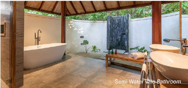
Semi Water Villa Bathroom