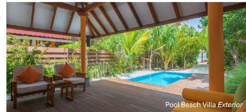
Pool Beach Villa Exterior