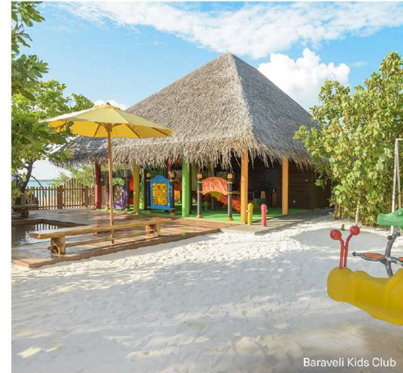
Baraveli Kids Club