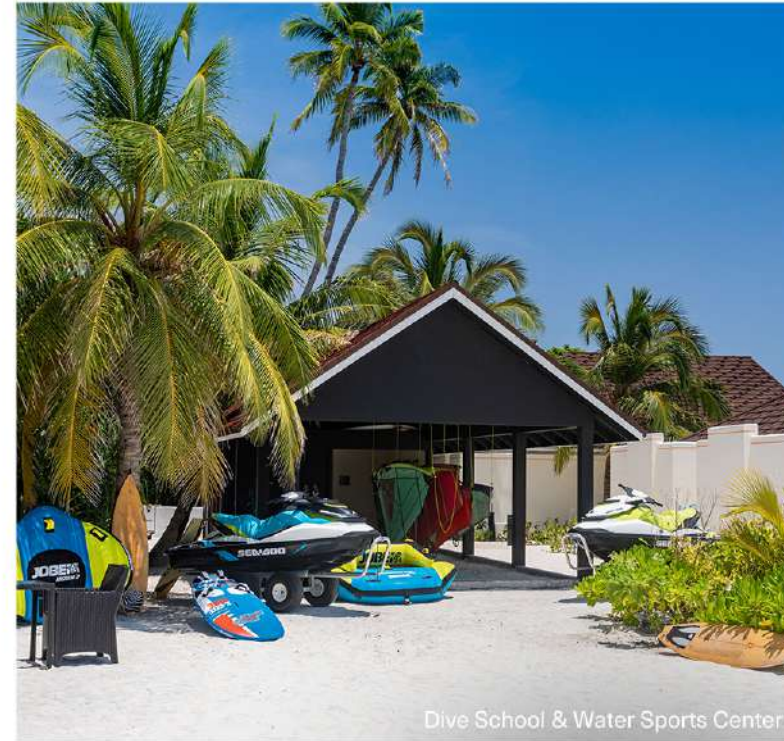
Dive School & Water Sports Center