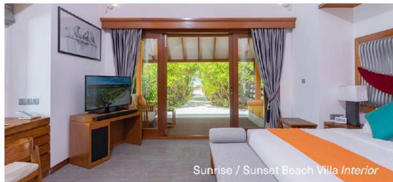
Sunrise / Sunset Beach Villa Interior