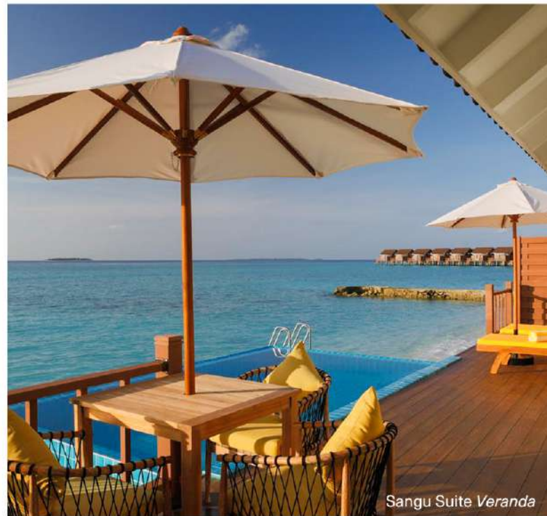
Sangu Suite Veranda