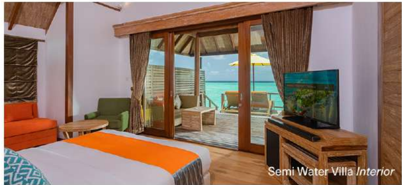
Semi Water Villa Interior