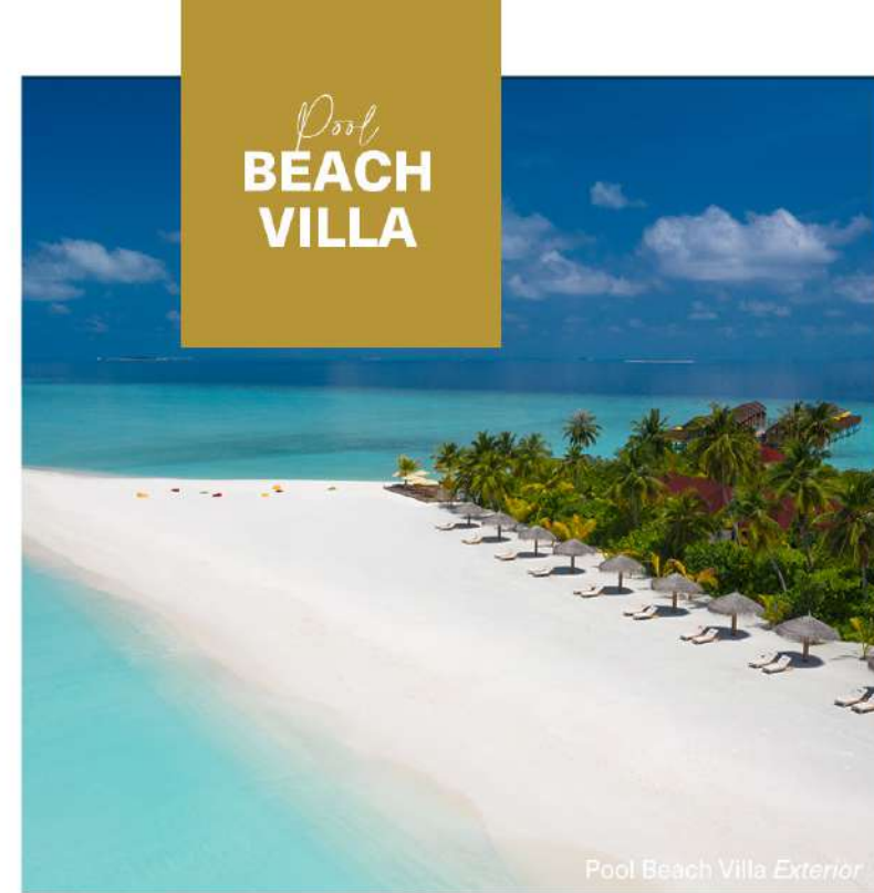
Pool Beach Villa Exterior