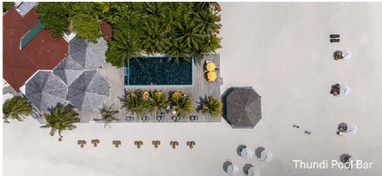
Thundi Pool Bar