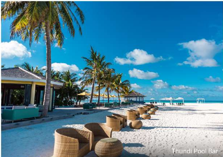
Thundi Pool Bar