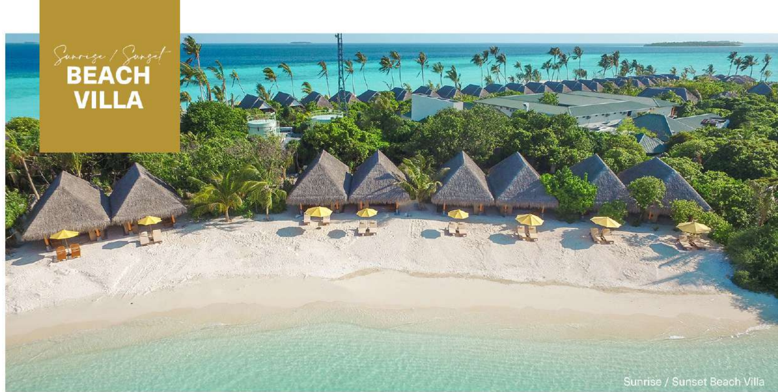
Sunrise / Sunset Beach Villa