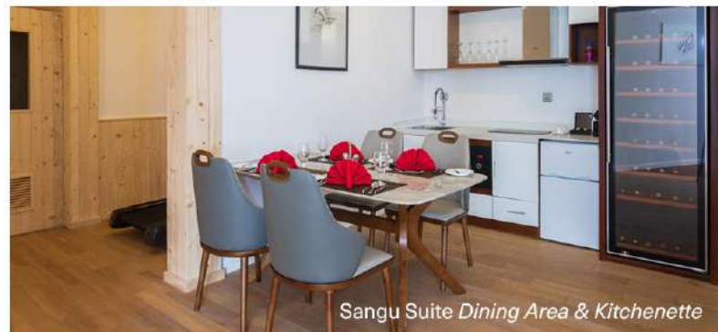
Sangu Suite Dining Area & Kitchenette