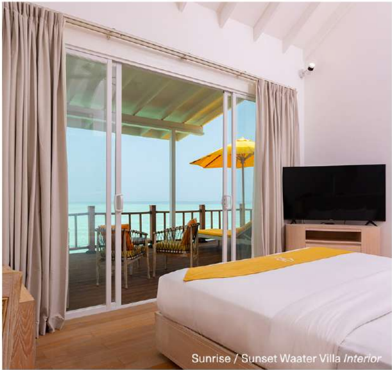
Sunrise / Sunset Waater Villa Interior