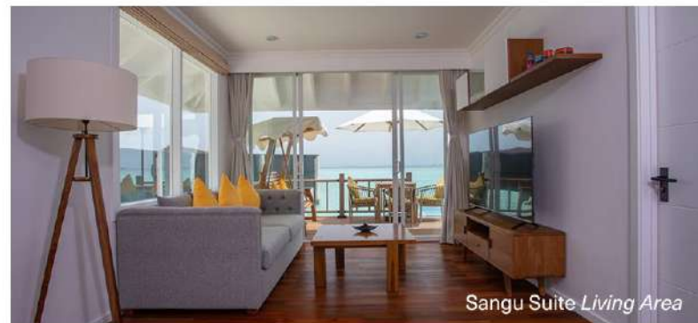
Sangu Suite Living Area