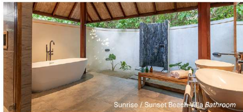
Sunrise / Sunset Beach Villa Bathroom