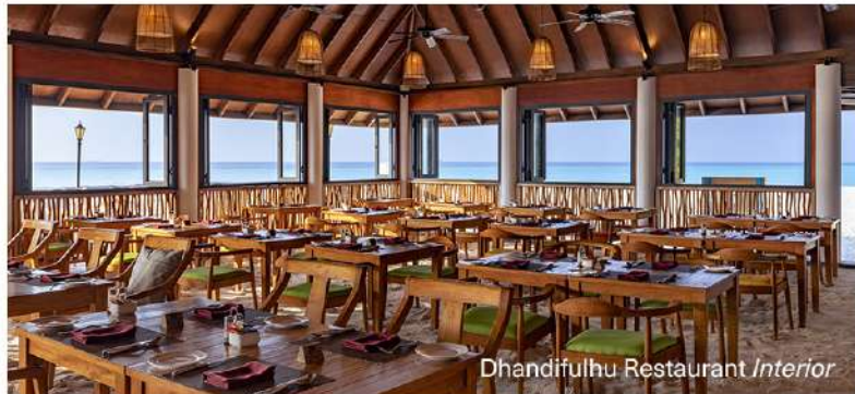
Dhandifulhu Restaurant Interior