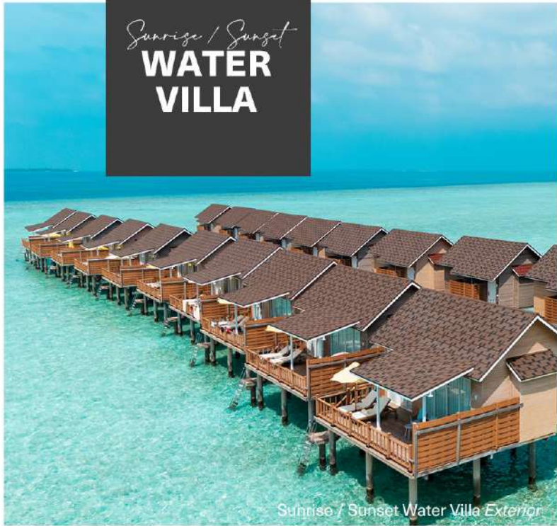
Sunrise / Sunset Water Villa Exterior