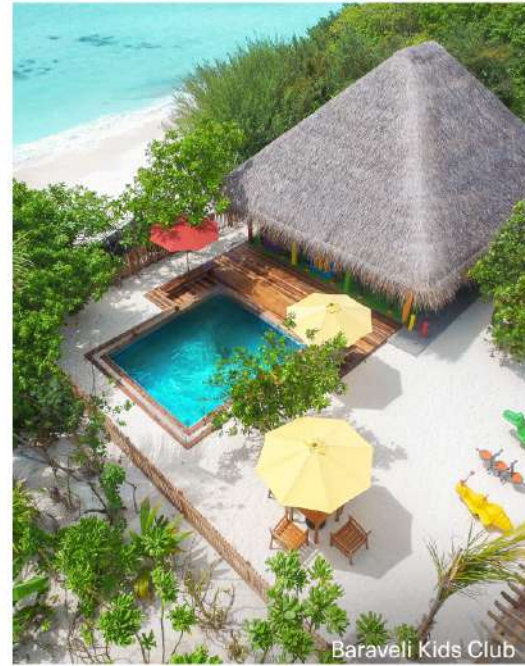
Baraveli Kids Club