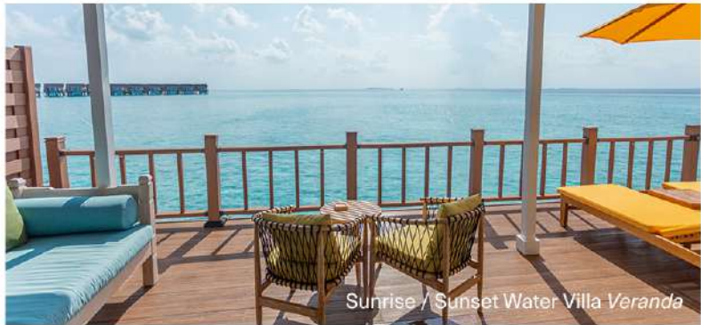
Sunrise / Sunset Water Villa Veranda