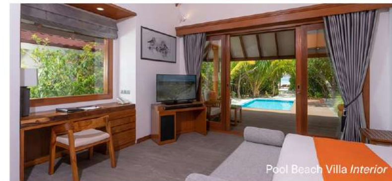
Pool Beach Villa Interior