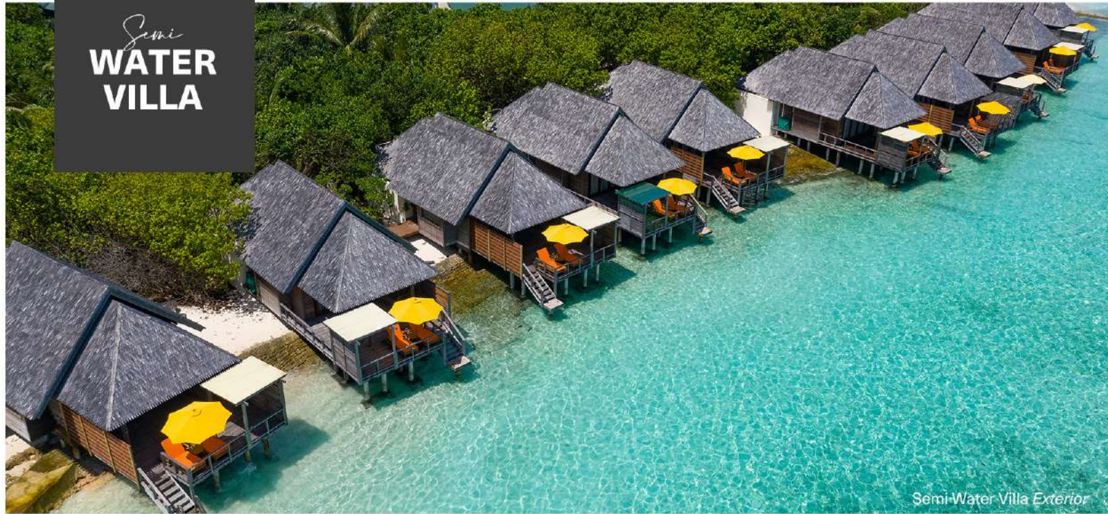
Semi-Water Villa Exterior