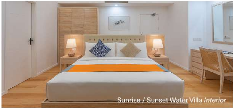
Sunrise / Sunset Water Villa Interior