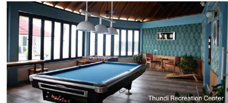
Thundi Recreation Center