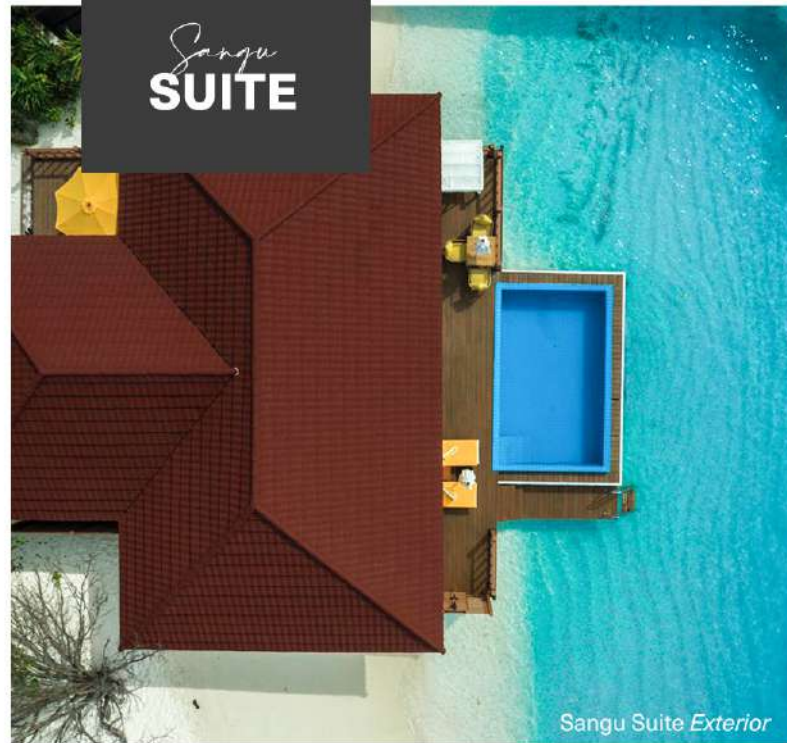
Sangu Suite Exterior